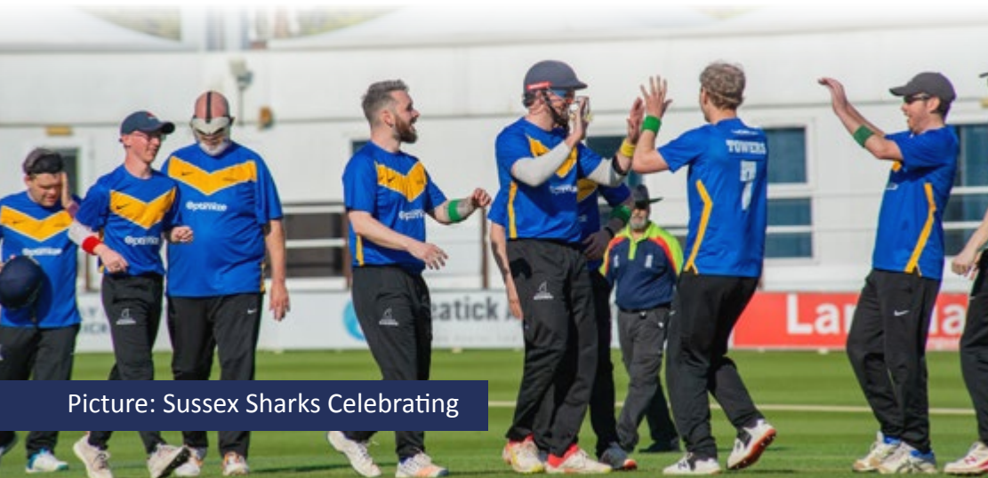
Picture: Sussex Sharks Celebrating